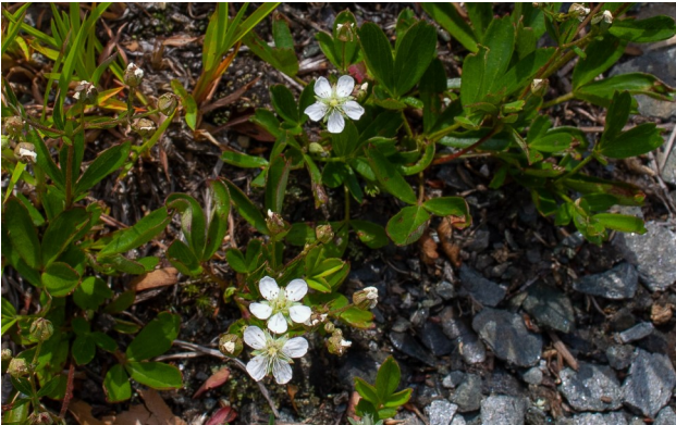
Three-toothed cinquefoil ( Sibbaldia tridentata )

Buffalo Mountain was protected with the support of The Nature Conservancy, Floyd County, and the 1992 Virginia Parks and Natural Areas Bond.