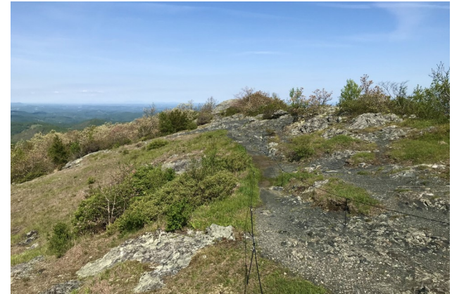
Buffalo Mountain summit